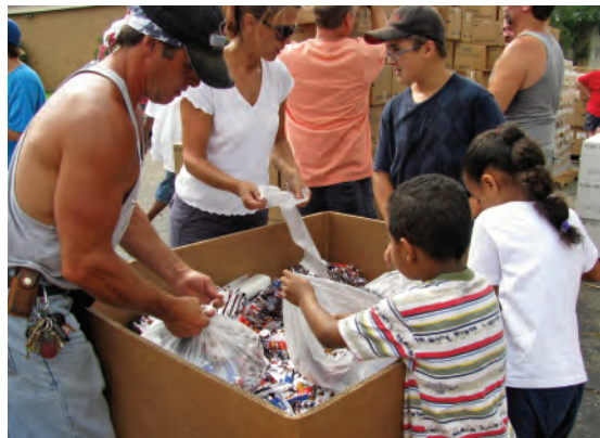
Left A thoughtful donation of candy brings a little extra joy to hungry children.