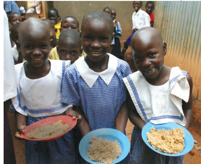
Uganda's children are her only hope for the future. Thank you for helping them grow up strong!

their bodies, Pastor Solomon provides food for their minds and souls. Feed The Hungry has donated books for the children's schooling, and every day the boys and girls learn more about God's plan for their lives.