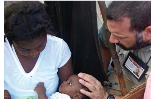
Every caring gift means so much to devastated families.

In July, three containers of food reached our partner, Mercy & Sharing, which serves as a distribution hub for 30 churches. Food is going out bi-weekly, supporting hundreds of families. So far it's come to over 40,000 meals, more than 44 tons of drinking water, and thousands of medical supplies, blankets, and water-proof tarps. Recently, we were able to send 5,000 Creole Bibles, which were eagerly received by people as hungry for spiritual nourishment as they are for food.