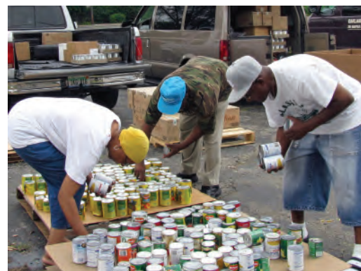
Below Distributed in Jesus' Name through local churches and ministries all over Detroit, this food showed God's love—and yours—to people in crisis situations.