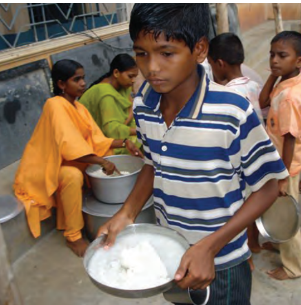
Thank you for good meals that show Dalit boys and girls they are precious.