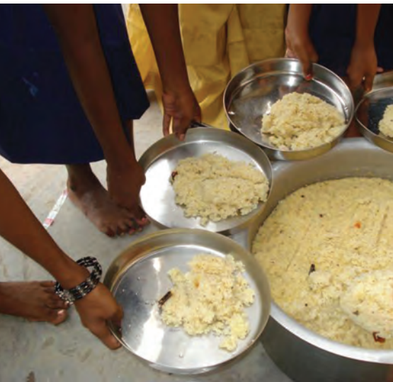
Left Nutritionally fortified rice meals give Dalit children the energy they need to play, learn, and worship God!